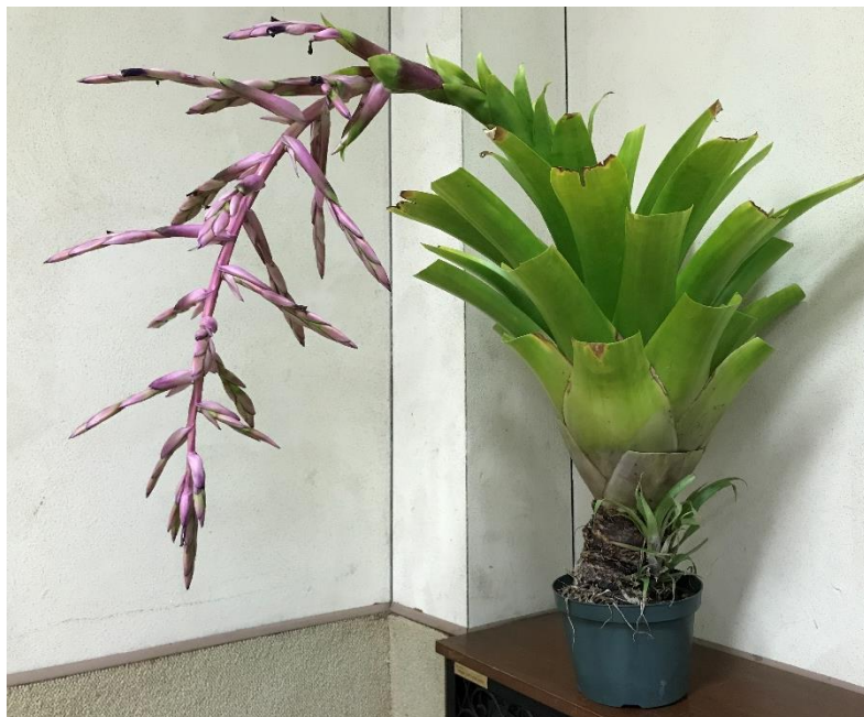
Tillandsia australis (Wow!)