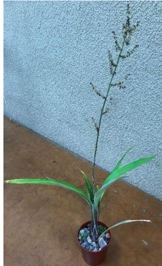
Fosterella albicans (plant and inflorescence detail) Tillandsia seleriana (middle right)